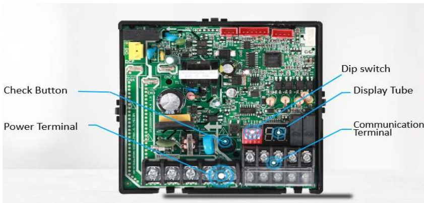
Set DIP Switches As Shown Below