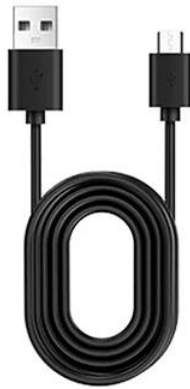
USB charging cable