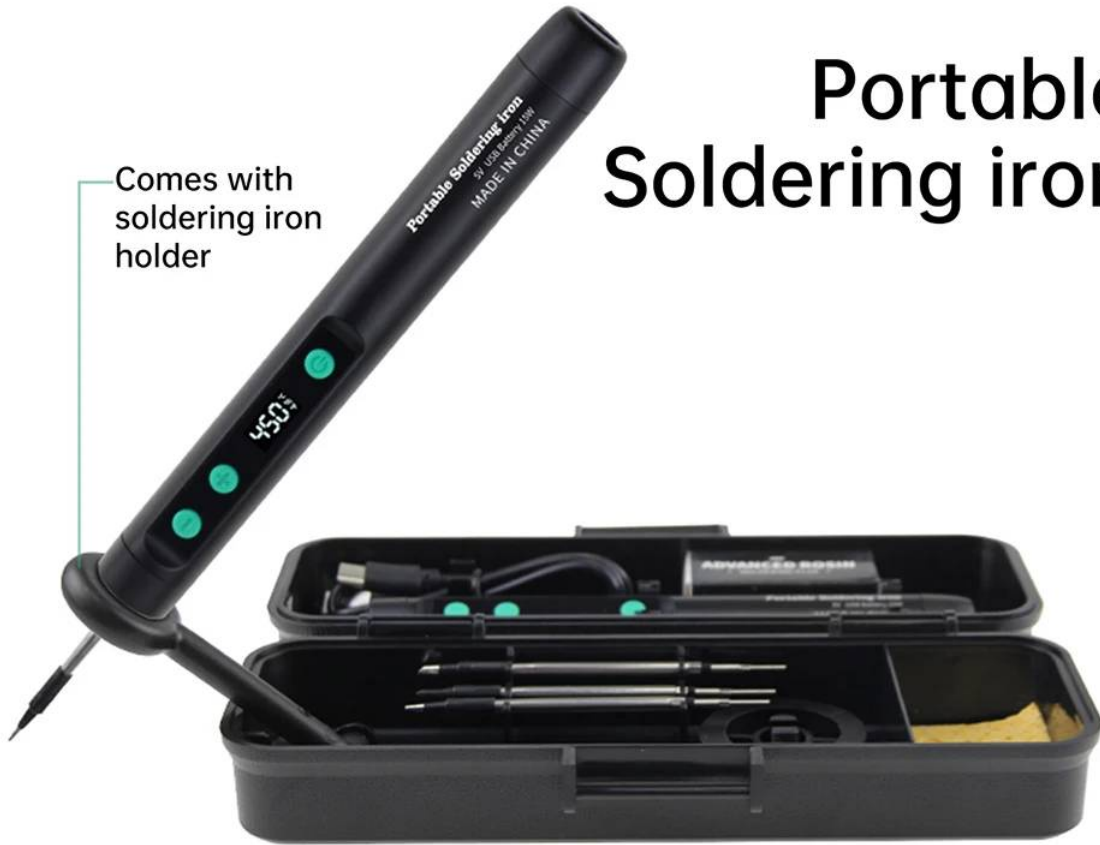
USB charging cable