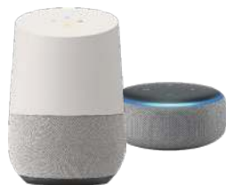
Voice Assistant (Not Included)