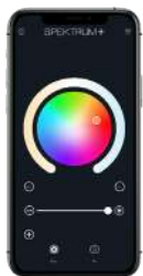
Spektrum+ Smart App