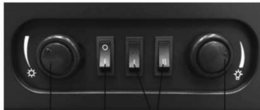
Adjustable thermostat knob ON/OFF switch Heating setting switch Flame adjustment knob