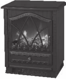
1X Heater body