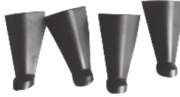
4X Sturdy stable foot