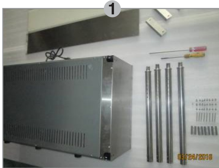
Remove all components from shipping container.