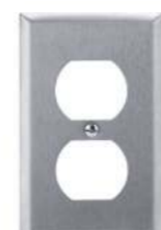
Stainless Steel Wall Plates