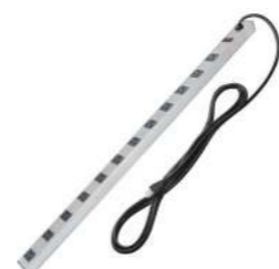
Metal Power Strips