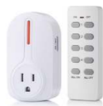
Remote Control Outlets