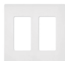
Screwless Wall Plates