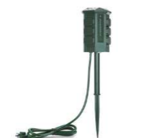
Outdoor Power Stakes