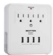
USB Wall Outlet Surge Protectors

For more products from BESTTEN, please visit our website www.ibestten.com