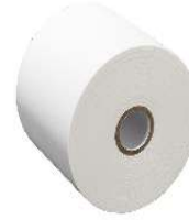
FILTER, PAPER 1 ROLL