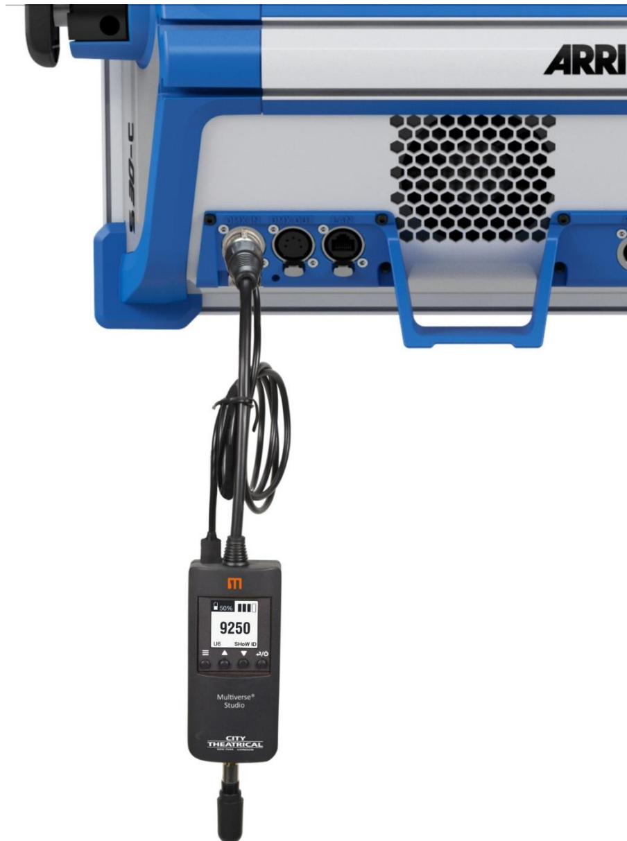
Figure 3: Connected to and Being Powered by USC Cable to Lighting Fixture