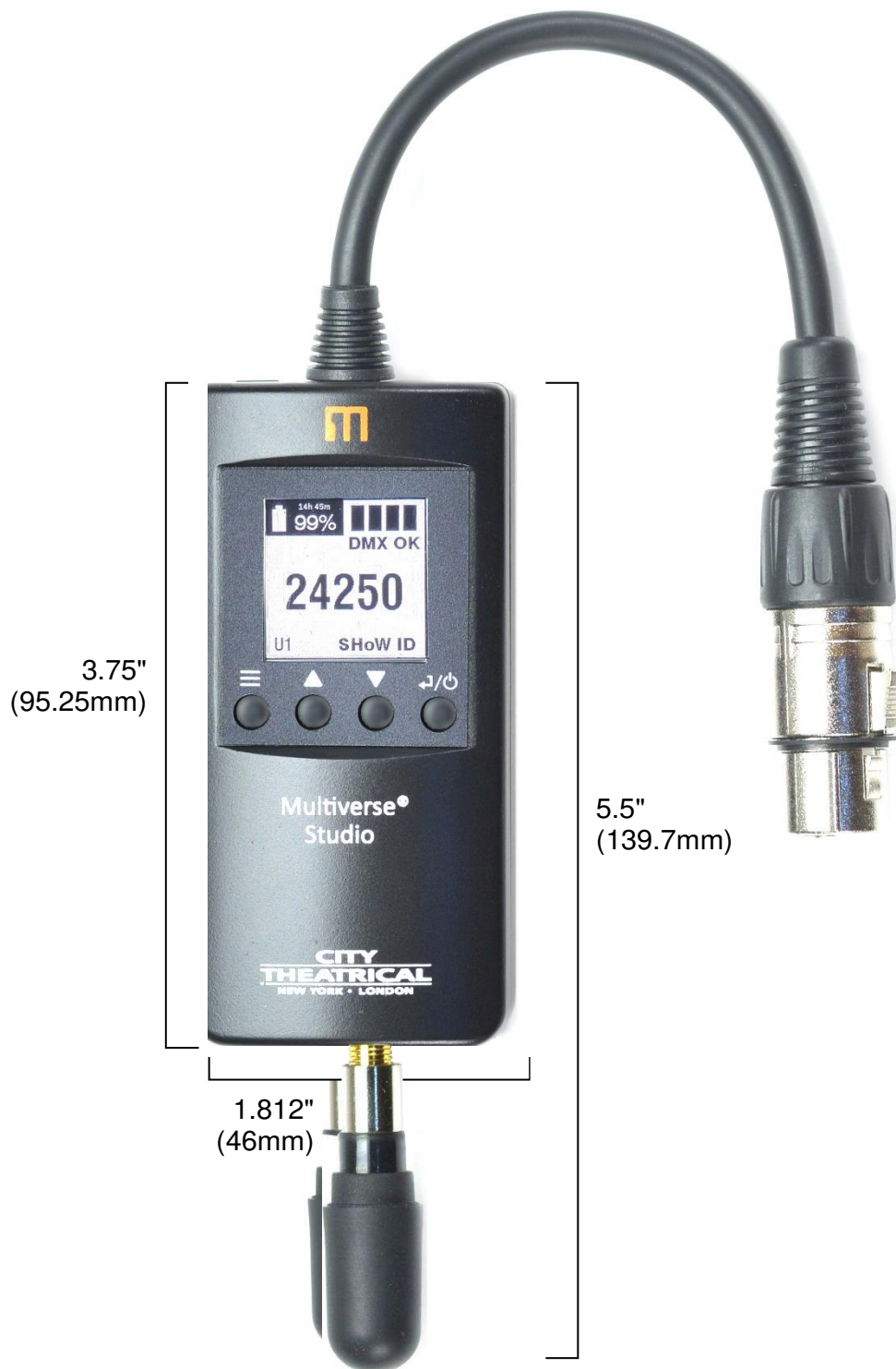
Figure 2: Face Panel