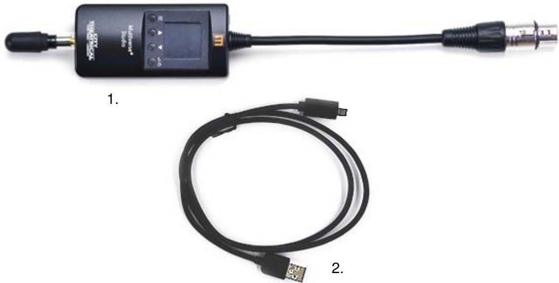
Figure 1: What's Included