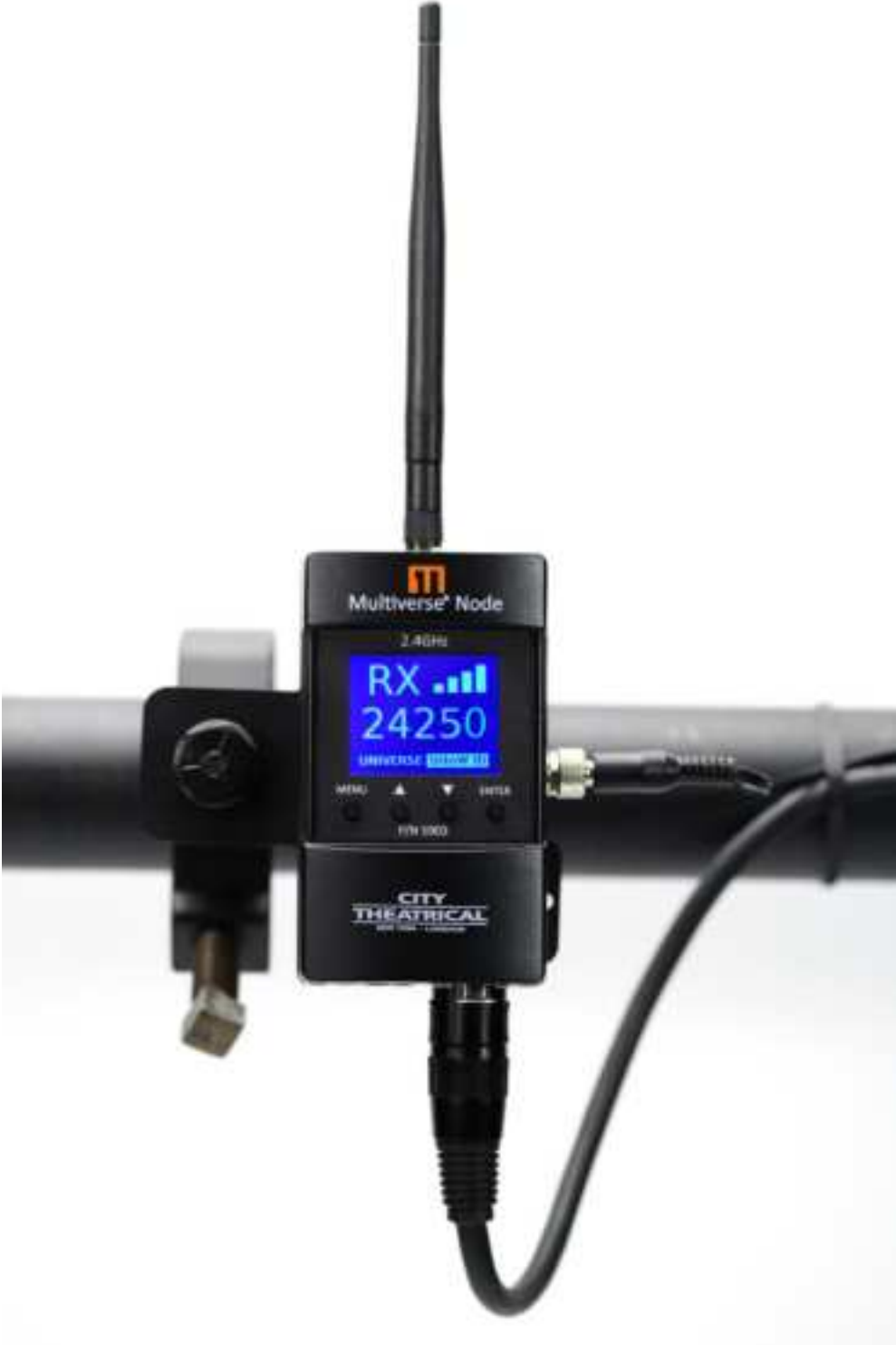
Figure 3: Pipe Mount