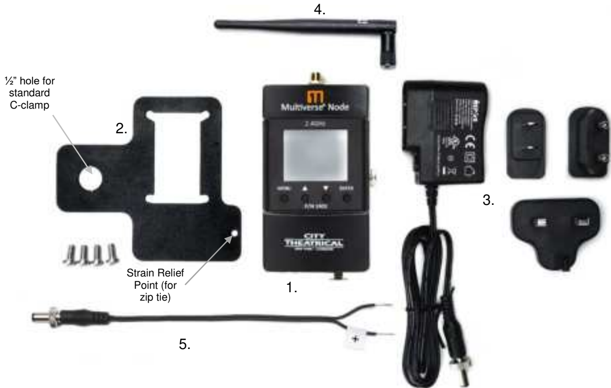
Figure 1: What's Included