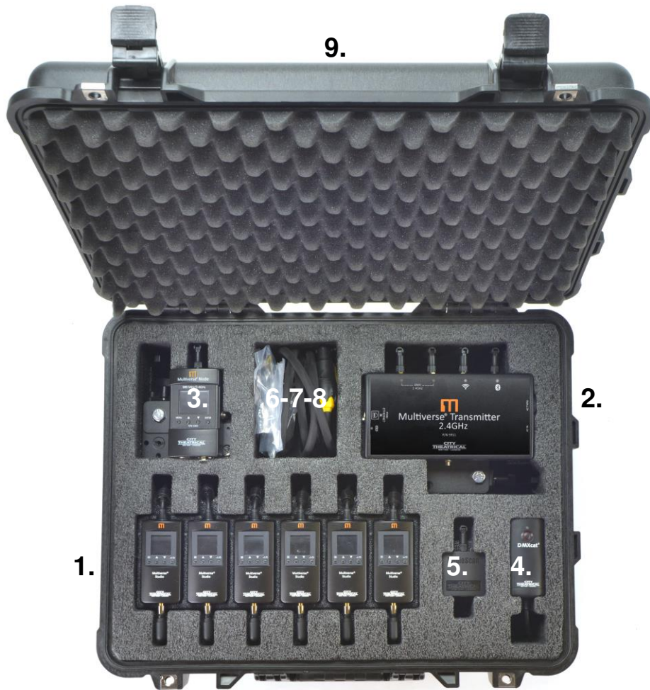
Figure 1: What's Included