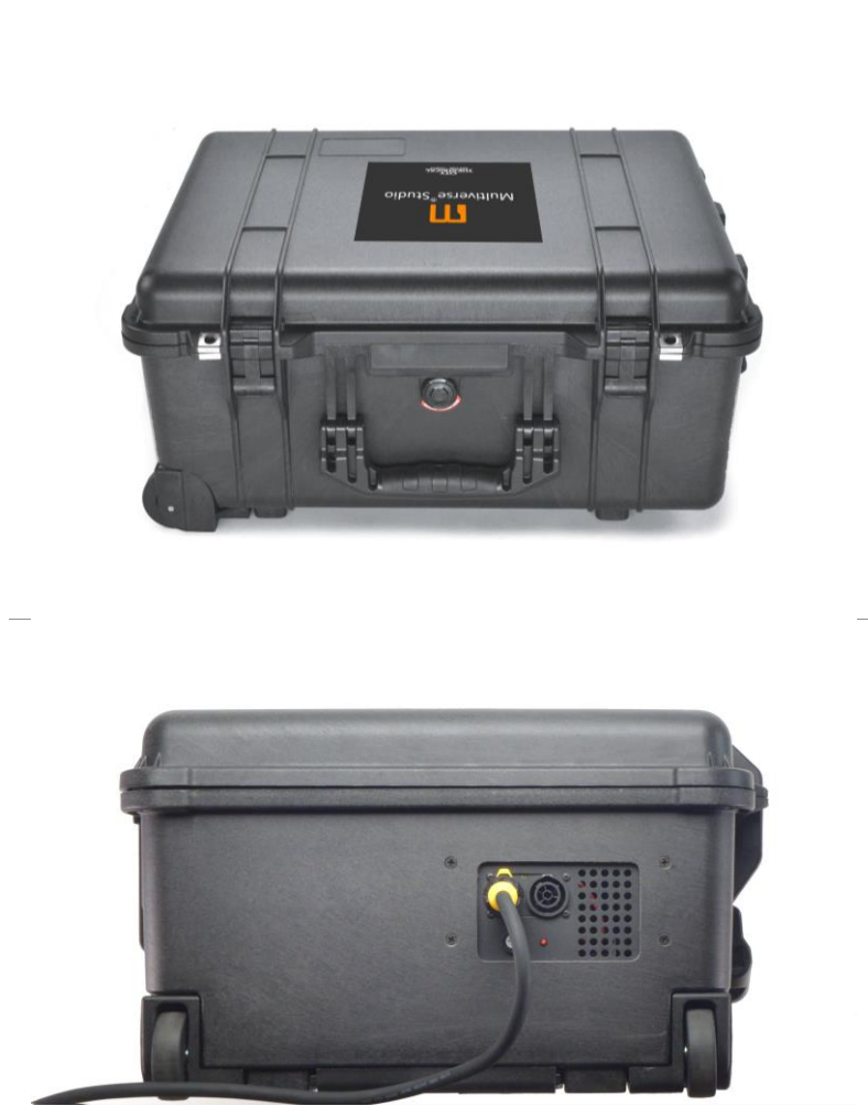
Figure 2: Face & Back Panel