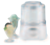
Ice Cream Makers

Cuisinart offers an extensive assortment of top quality products to make life in the kitchen easier than ever. Try some of our other countertop appliances and cookware, and Savor the Good Life®.