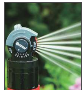
LOWER LEVEL (3-1) Adjust the spray downwards to reduce the watering area.