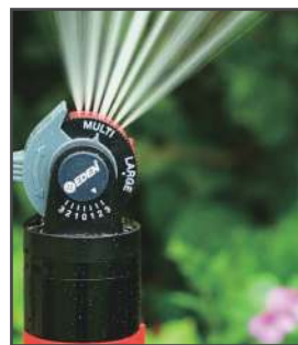
HIGHER LEVEL (1-3): Adjust the spray upwards for maximum distance.