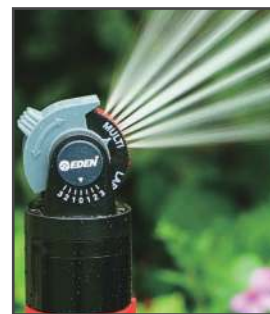
LEVEL (0) Adjust the spray in between a dispersed and concentrated watering area.