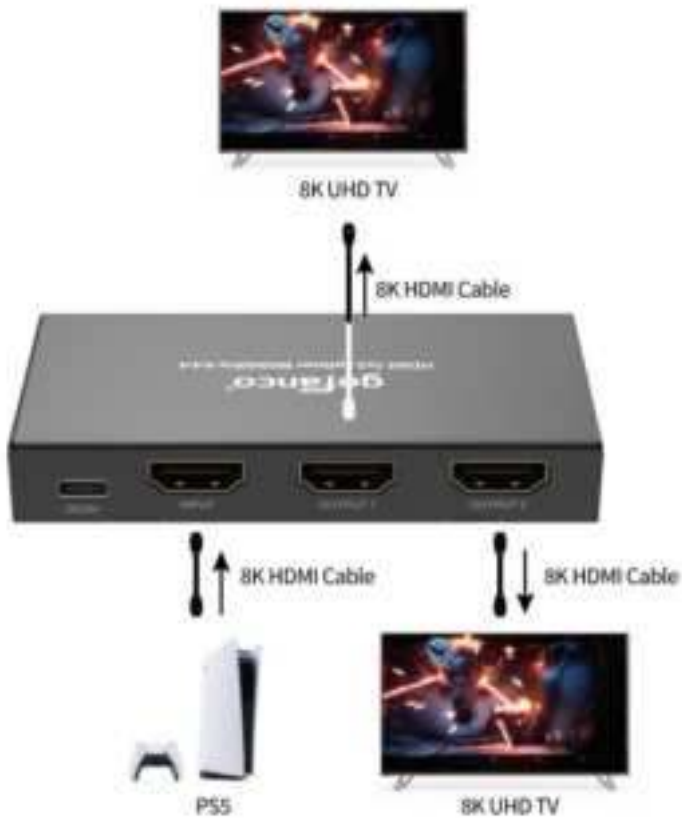
Figure 2: Connection Diagram