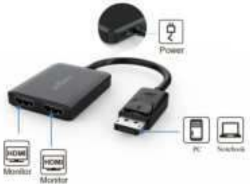
Figure 2: Connection Diagram