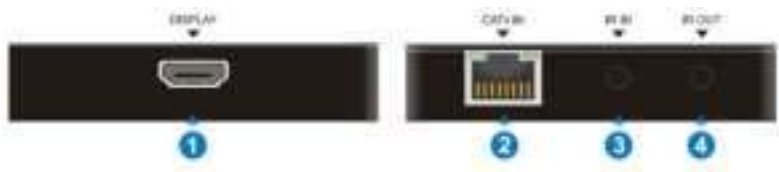
Figure 3: CAT 6/7 Receiver Front and Back Panel Layout