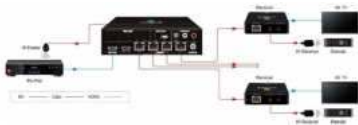
Figure 5: Source Device IR Control Connection Diagram