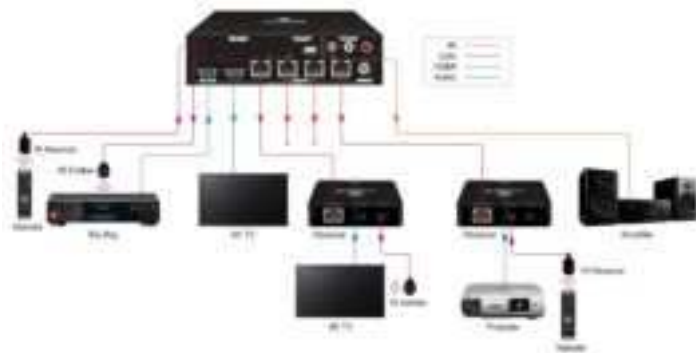
Figure 4: Application Diagram

The application diagram shows the most typical input and output devices used with the Splitter/Extender.