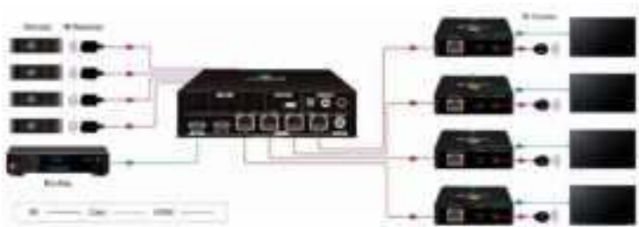
Figure 6: Display Device IR Control Connection Diagram