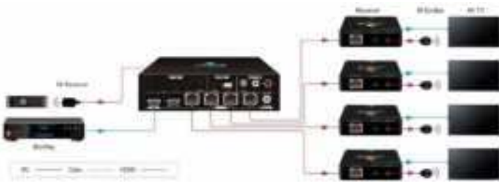
Figure 7: Display Device IR Control Connection Diagram