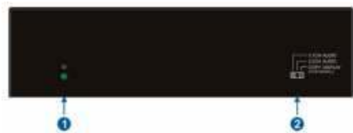
Figure 1: 1x4 HDMI 1.4 Splitter/Extender Front Panel Layout