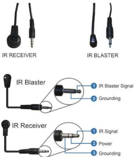
Figure 5: IR Cable Pin Definition