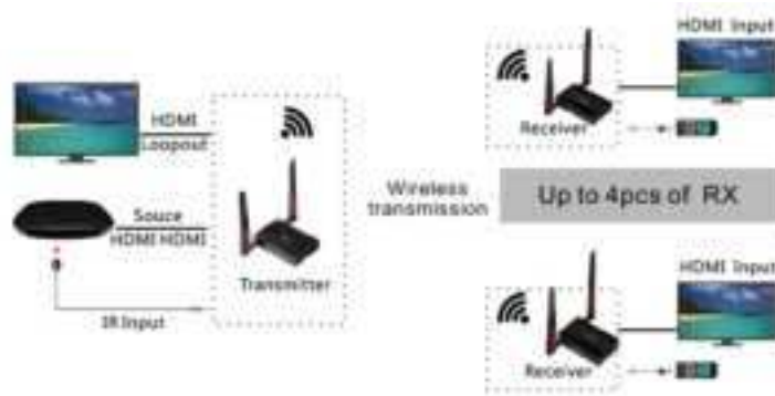
Figure 4: One TX to Two RXs Shown

Supports up to four Receivers (RX). Additional Receivers, part# HDwireless1x4-RX, sold separately.