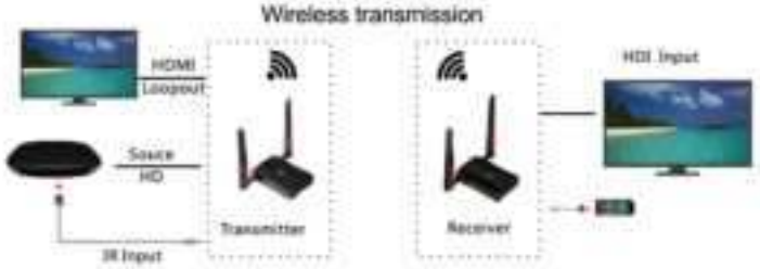
Figure 3: One TX to One RX