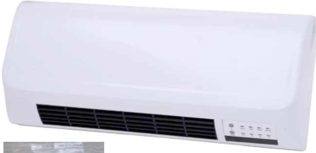
Main Unit x 1