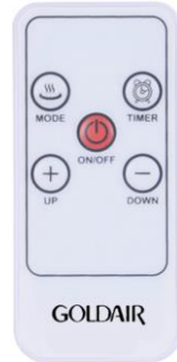
Remote x 1