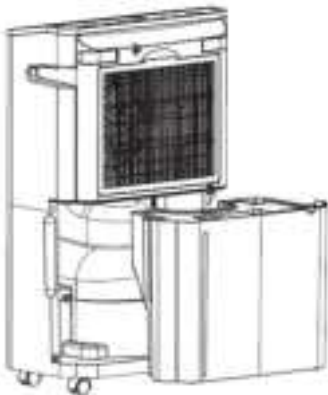
REMOVING AND EMPTYING THE WATER TANK