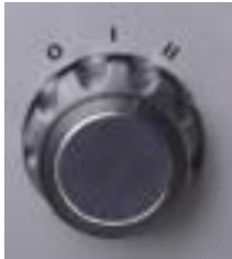
HEAT CONTROL SWITCH