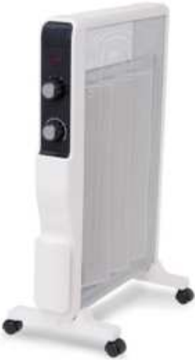
Main Body x 1