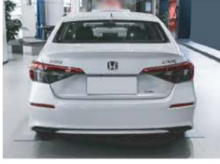
Civic Hatch Front Parking Sensor Installation