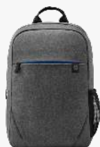
HP Prelude 15.6-inch Backpack 2Z8P3AA