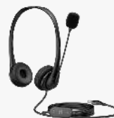
HP Stereo USB Headset G2 428H5AA