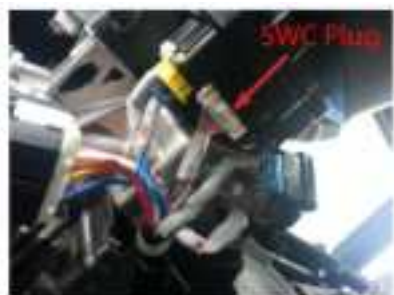
Figure 1 (Civic)