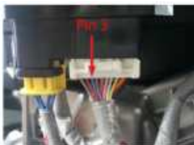
Figure 2 (Civic)