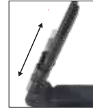
2. Adjust shelf up or down