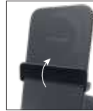
1. Flip shelf to up position