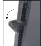
3. Flip shelf down to lock in place