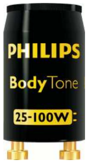
BodyTone 25-100 W, BK