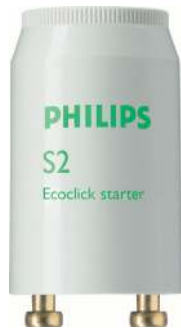
LPPR STARTER PHL 0004