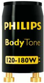
BodyTone 120-180 W, BK