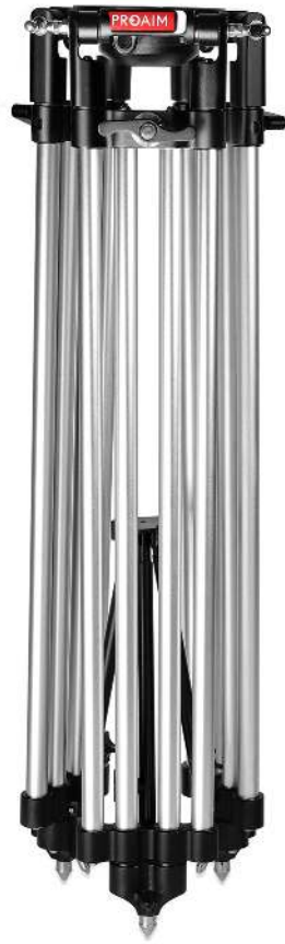
150mm Camera Tripod Stand

Please inspect the contents of your shipped package to ensure you have received everything that is listed below.