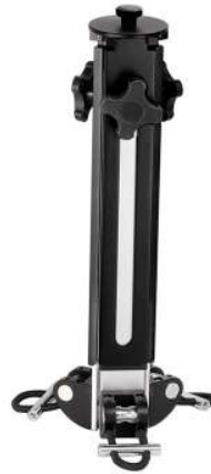
Aluminum Tripod Spreader