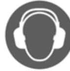
Wear ear protection