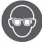
Wear eye protection