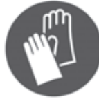
Wear protective gloves