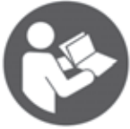
Refer to instructions

IMPORTANT: PLEASE READ THESE INSTRUCTIONS CAREFULLY. NOTE THE SAFE OPERATIONAL REQUIREMENTS, WARNINGS & CAUTIONS. USE THE PRODUCT CORRECTLY AND WITH CARE FOR THE PURPOSE FOR WHICH IT IS INTENDED. FAILURE TO DO SO MAY CAUSE DAMAGE AND/OR PERSONAL INJURY AND WILL INVALIDATE THE WARRANTY. KEEP THESE INSTRUCTIONS SAFE FOR FUTURE USE.