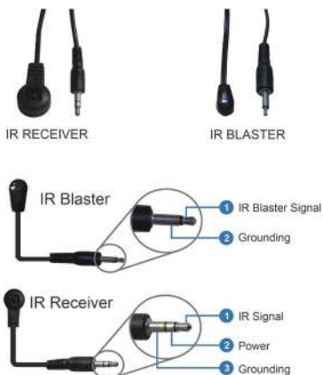
Figure 5: IR Cable Pin Definition