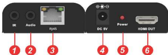
Figure 2: Receiver connectors