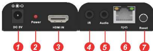
Figure 1: Transmitter connectors