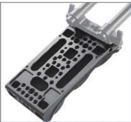
Used with Shoulder Pad 2057