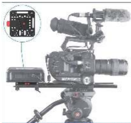
Used with V Mount Plate 1846