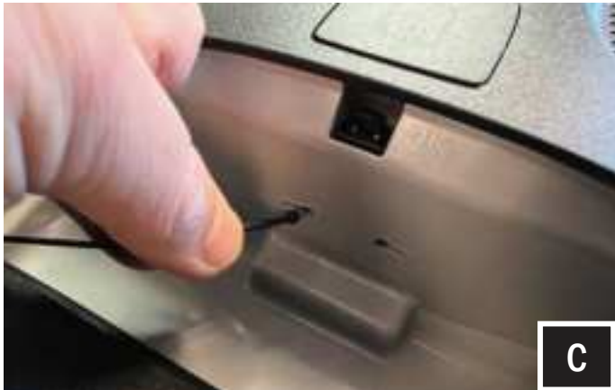
C. Unhook the (2) rubber limiter bands in the sunglasses holder.