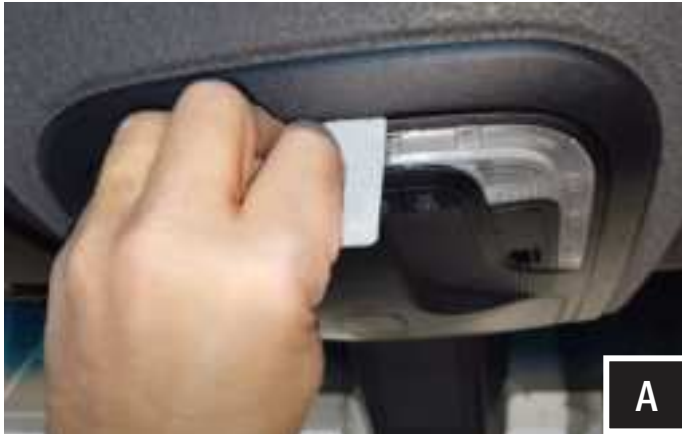
A. Insert a credit card in the middle front side of the overhead console to release the lock and slide out the overhead console.