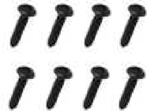
#7-19 Phillips Screw (x8) [B-S1656]