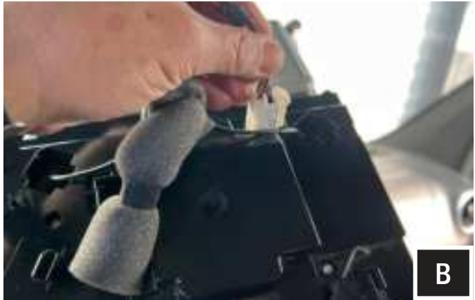
B. Unplug the connectors behind the overhead console.