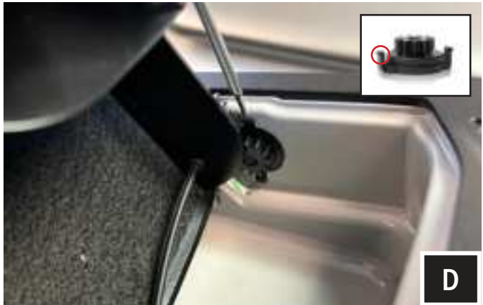
D. Remove the plastic rotary damper by carefully pressing on the lock.