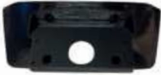
Sprinter Overhead Fascia [B-D3469]