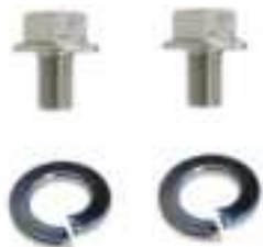
M8x12 Flanged Hex Bolt & M8 Split Washer (2 ea) [B-S3285 & B-W3176]