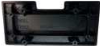
Sprinter Overhead Mounting Bracket [B-D3470]