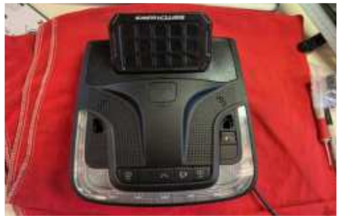
Completed installation of the Sprinter ALPHA12 Overhead Mounting kit.