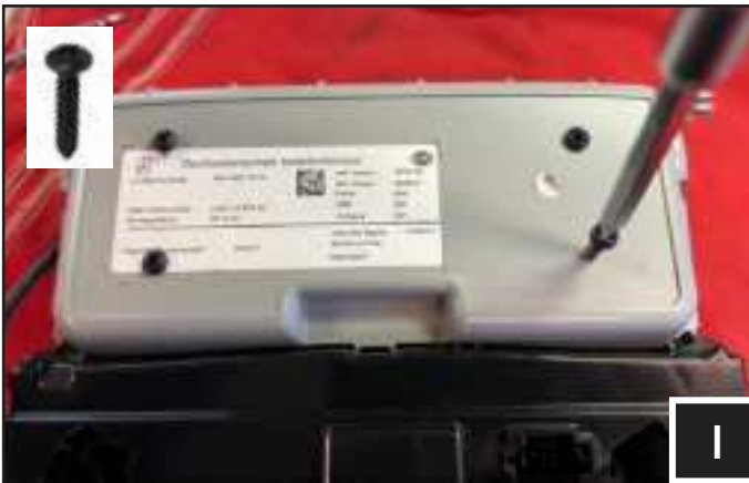
I. Hold the Sprinter mounting bracket in the sunglass holder cavity while fastening the back side with (4) #7-19 screws (B-S1656).