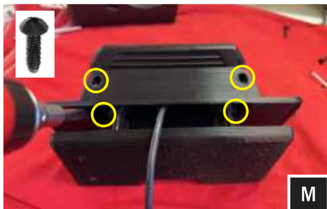
M. Use (4) 4-40x.375 Thread Cutting screws [B-S3262] to secure the 15-button controller to the Sprinter ALPHA12 overhead mounting kit.