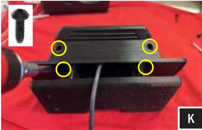
K. Use (4) 4-40x.375 Thread Cutting screws [B-S3262] to secure the 15-button controller to the Sprinter ALPHA12 overhead mounting kit.