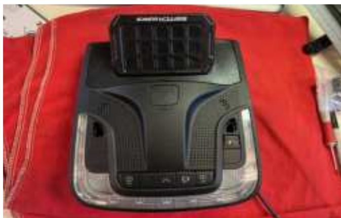
Completed installation of the Sprinter ALPHA12 Overhead Mounting kit.

THIS CONCLUDES THE INSTALLATION PROCESS. QUESTIONS? PLEASE CONTACT SSV WORKS AT 818-991-1778 OR EMAIL SUPPORT@SSVWORKS.COM