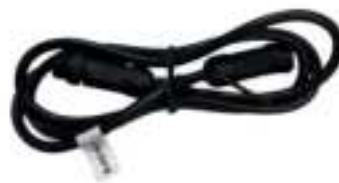
4-Pin Controller Extension Cable, 6 ft.