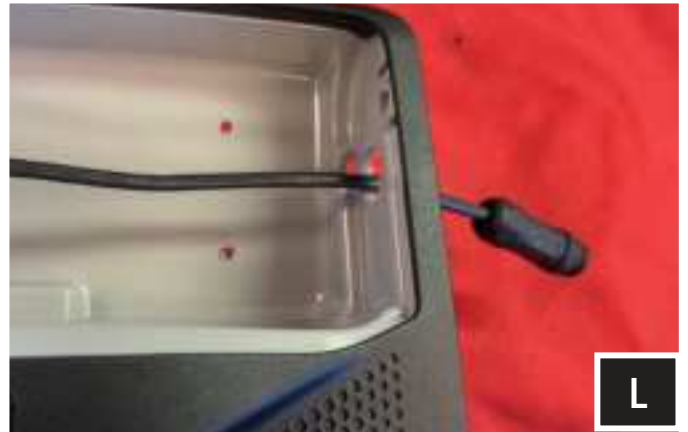
L. Insert the controller cable through the plastic rotary damper hole.