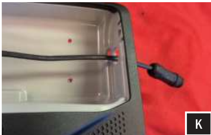
K. Insert the controller cable through the plastic rotary damper hole.