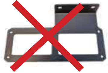
Sprinter ALPHA12 Brain Mount Bracket [B-MB]