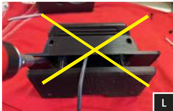
L. Line up the 15-button controller on the Sprinter ALPHA12 overhead mounting kit. Pay attention to the a