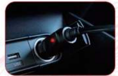
12V & 24V 2 in 1 Vehicle Plug Use