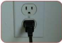
110V Wall Plug Use