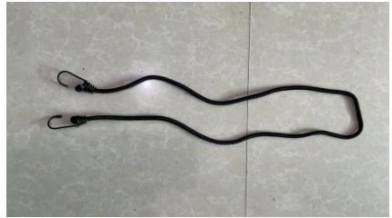
G.Elastic Binding Rope(x2)