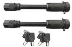
#3 Security lock x 2