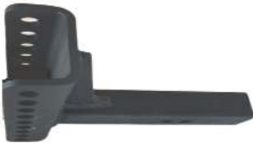
#1 Channel mount x 1