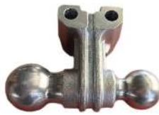
#2 Dual ball x 1