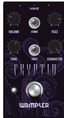
Misbiased 'Tone Bender' type fuzz