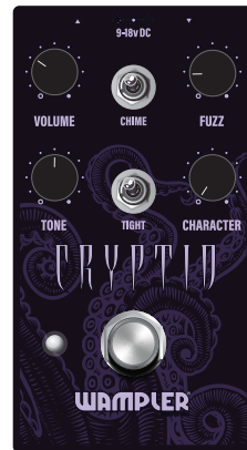
Chimey 'SRV' - Make sure there is no buffer in front, roll guitar volume back, switch to neck pickup