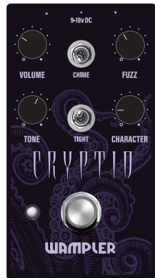
Silicon BC108 'Fuzz Face' style