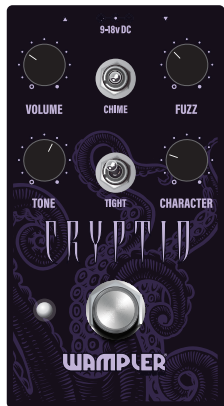
Germanium 'Fuzz Face' sounds