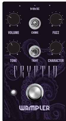
'Muff Fuzz' style but with more Mids