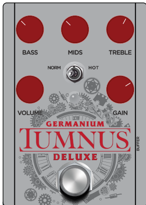
Thin Out the Hums