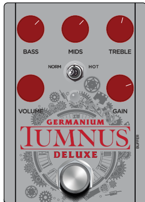
Crank up a Single Coil